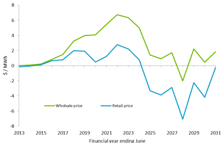
Figure 32 Change in wholesale and change in retail prices – updated 20% target compared with reference case 1 ($/MWh)

While the Discussion Paper outlines how the consumer savings from a “real 20%” target will not be substantial, the updated Figures in the Corrigenda make the case even more compelling. Figure 32 (below) shows no material change in retail prices with the reduced LRET target through 2015, after which consumers are predicted to experience higher retail prices with the reduced “real 20%” target compared with the current 41,000 GWh target (until 2024). This is an important point that we believe is worthy of inclusion in the final report.